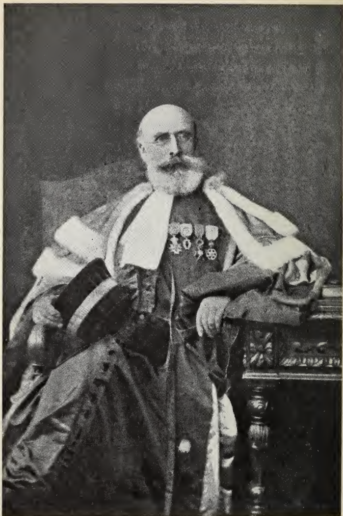
PIERRE JACQUES ANTOINE BÉCHAMP when Professor of Medical Chemistry and Pharmacy at the University of Montpellier 1857-1875