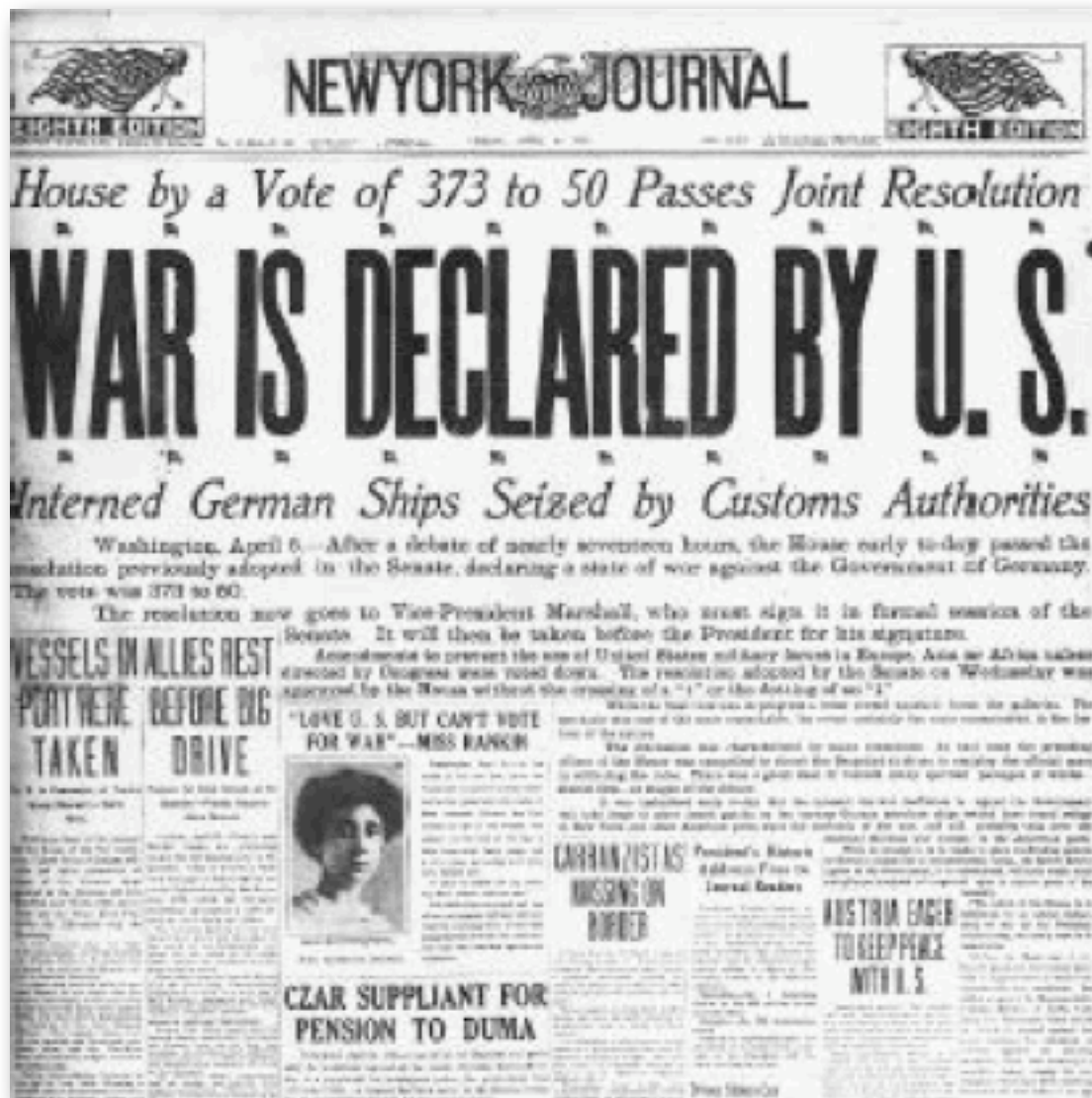
[Image] A New York Journal headline marks the entrance of the United States into World War I, April 6, 1917.

Even before that, however, he and Brandeis had been planning war, and it was their secret assurances that the United States would be brought into the war that led British leaders to reject Germany's peace offer of December 12, 1916. If that offer had been accepted, the lives of some three million White soldiers — including 115,000 Americans — Which were consumed in 1917 and 1918 would have been spared. Furthermore, the Second World War, which grew out of the unjust conditions imposed on Germany after the Allied victory, would have been avoided. And if Russia could have had peace in December 1916, she probably would have had time to stamp out the Bolshevik virus being spread among her soldiers and workers by the Jews, and Communism would have suffered a setback from which it might never