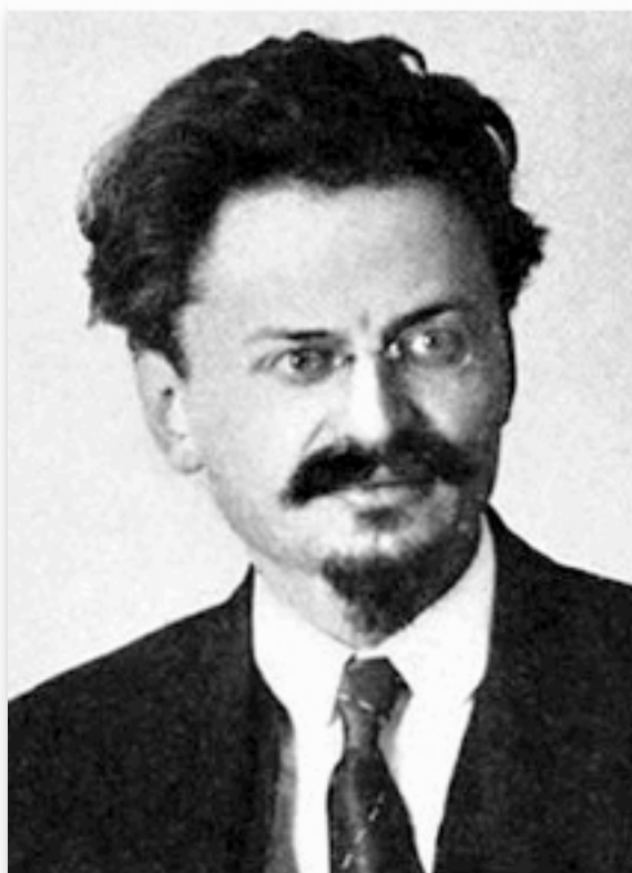
[Image] Leon Trotsky born Lev Davidovich Bronshtein (7 November 1879 – 21 August 1940) was a Russian Marxist revolutionary and theorist, Soviet politician, and the founder and first leader of the Red Army.