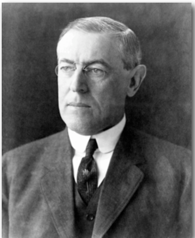
[Image] Thomas Woodrow Wilson (December 28, 1856 – February 3, 1924) was the 28th President of the United States from 1913 to 1921.