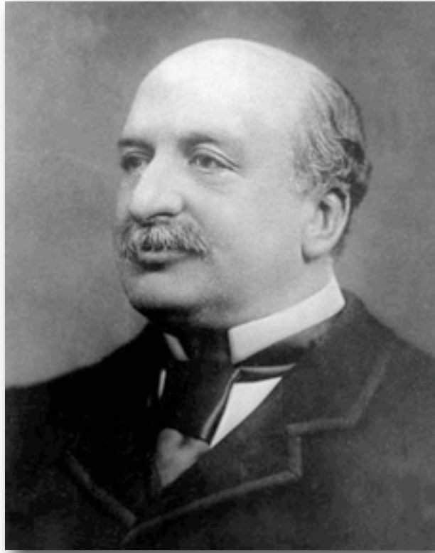
[Image] Lionel Nathan de Rothschild , OBE (25 January 1882 – 28 January 1942) was an English banker and Conservative politician.

The last provision, added at Jewish insistence, reveals the Zionists' intention that Jews everywhere should be uniquely favored by being permitted to enjoy the citizenship, with full rights and privileges, of both the Gentile country in which they happen to reside at the moment and of their " national home " in Israel.