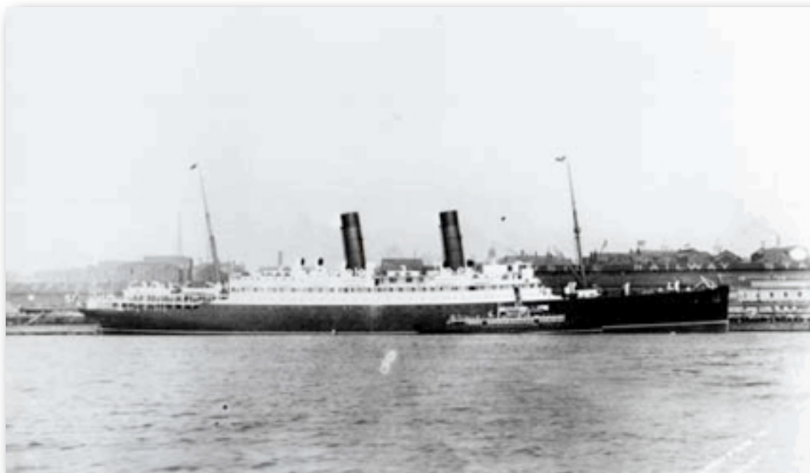
[Image] RMS Laconia was a Cunard ocean liner built by Swan Hunter & Wigham Richardson, launched on 27 July 1911.

For example, when a German submarine sank the British ship Laconia [4] on February 25, 1917, with the loss of three Americans who were aboard, Wilson and the press put on a great show of moral outrage at this act of German “ barbarism ,” treating it as an intolerable affront to American sovereignty.