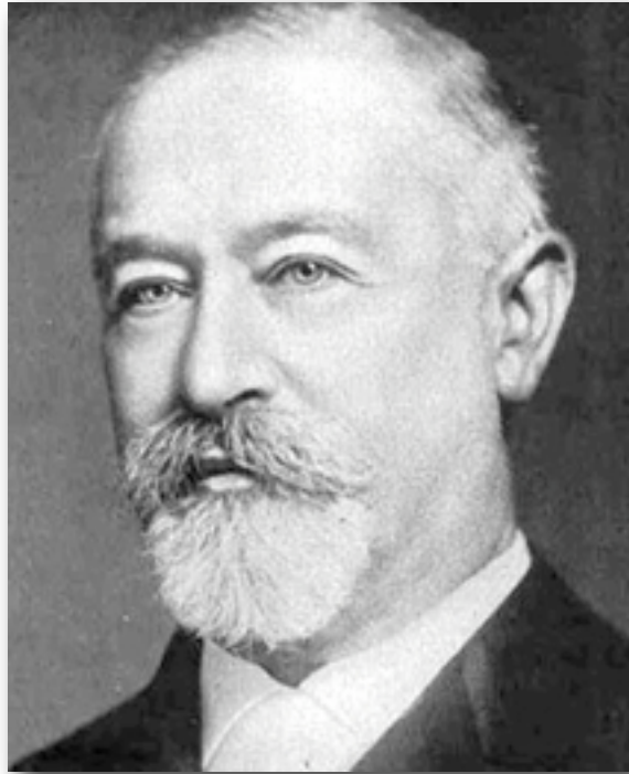
[Image] Jacob Henry Schiff (born Jakob Heinrich Schiff; January 10, 1847 – September 25, 1920)