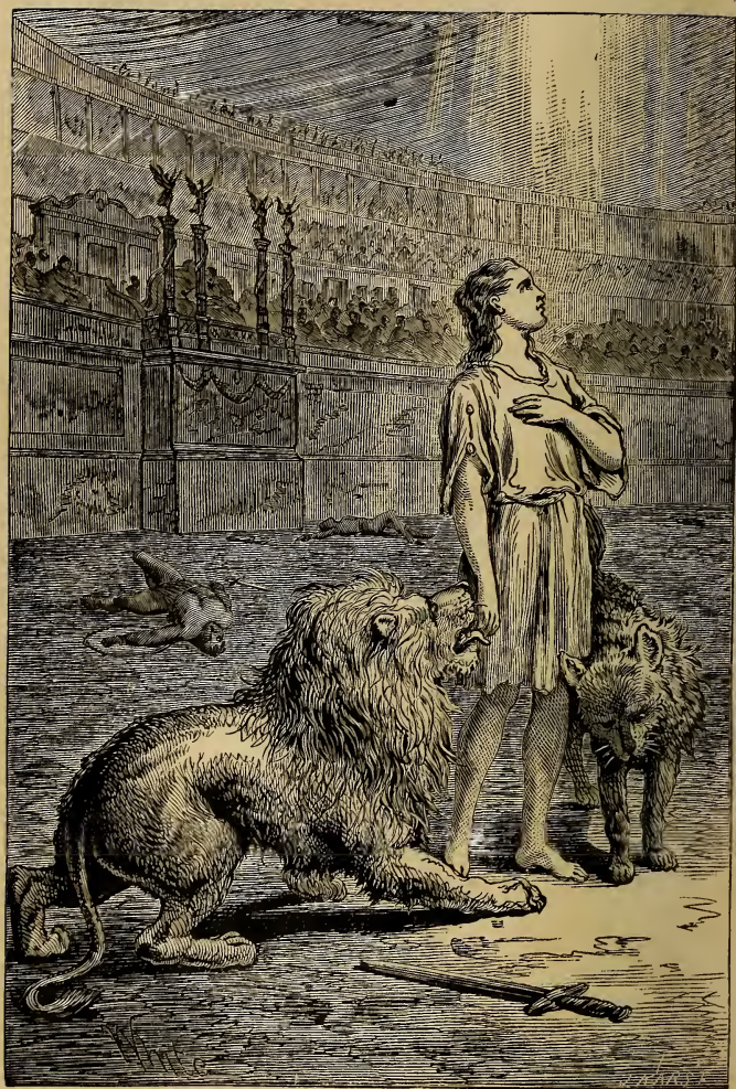
The Martyrs of the Coliseum.