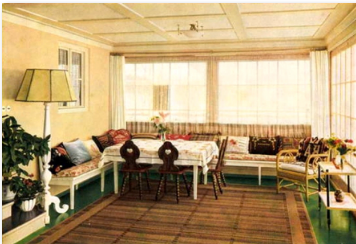
A CORNER OF THE SUN-PARLOUR OVER-LOOKING THE TERRACE.

The gardens are laid out simply enough. Lawns at different levels are planted with flowering shrubs, as well as roses and other blooms in due season. The Führer, I may add, has a passion for cut flowers in his home, as well as for music.