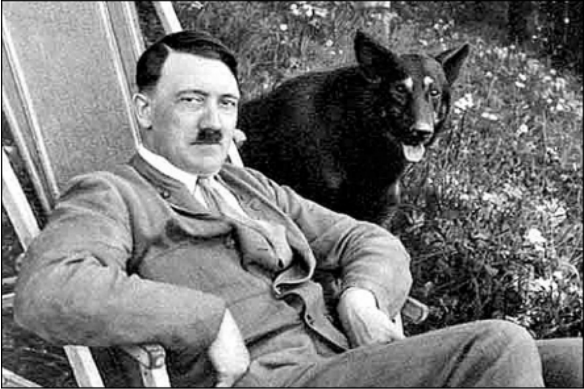
IN HIS HOURS OF EASE – THE FÜHRER IN THE GARDEN, WITH ONE OF HIS PEDIGREE ALSATIANS BESIDE HIM.

But I have said enough to convey the idea of a sunny sub-alpine home, hundreds of miles from Berlin's uproar, and set amid an unsophisticated peasantry of carvers and hunters. This is a only home in which Hitler can laugh and take his ease — or even " conduct tours " by means of the tripod telescope which he himself operates on the terrace for his visitors. " This place is mine, " he says simply. " I built it with money that I earned. " Then he takes you into his library, where you note that quite half the books are on history, painting, architecture, and music. When it is fine enough to dine in the open air, one sees a piano made ready for the after-dinner concert. Local talent will supply violin and cello for pieces by Mozart or Brahms. But at the piano itself it is always that English-speaking giant (he is 6 ft. 4 ins.) — Dr. Ernst (" Putzi ") Hanfstaengl who presides as a composer of all-German renown.