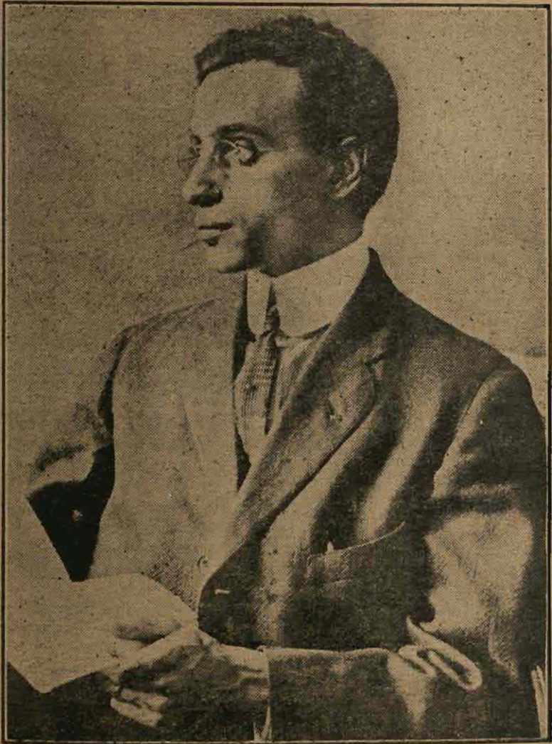
LEO M. FRANK, the Accused.