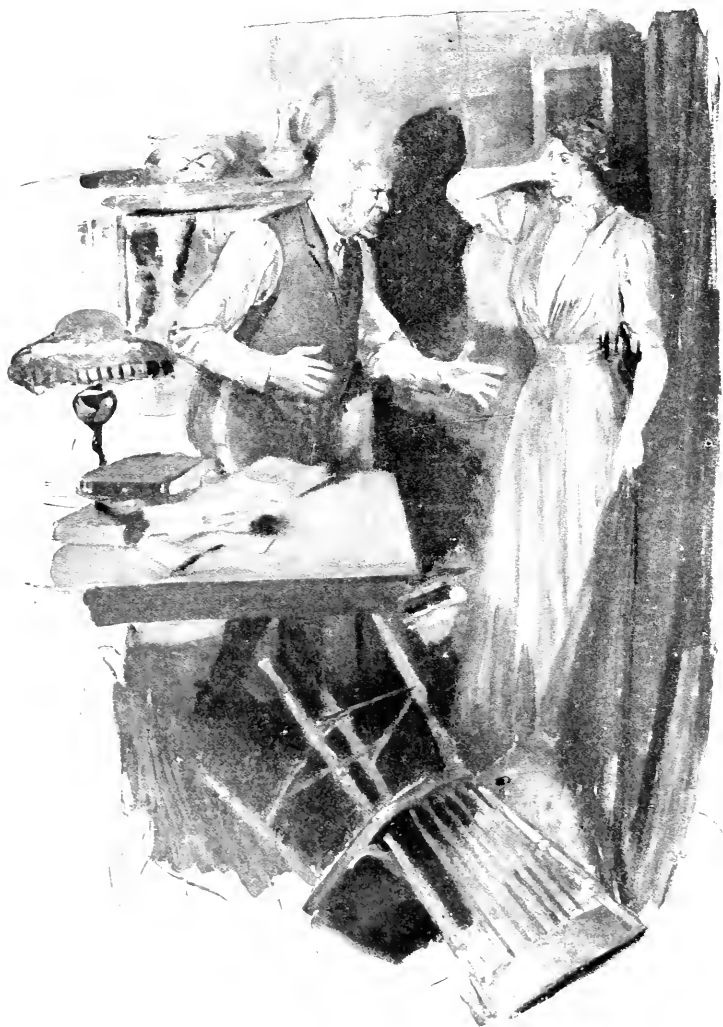
“WOLF GRASPED HER.”