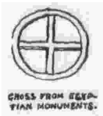
CROSS FROM EGYPTIAN MONUMENTS.